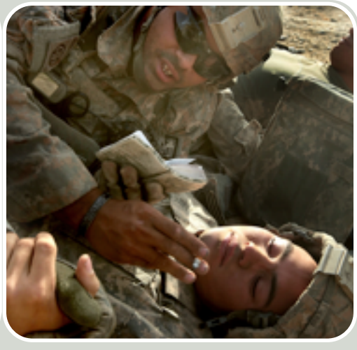
THOUGHTS TO PONDER WHILE YOU READ Daniel 10

Have you ever been so afraid that you were shaking?